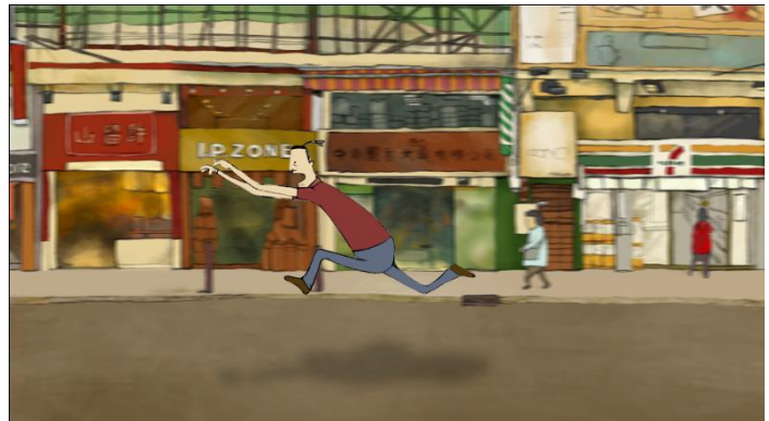
“Mind Blossom” by Choi Lai Wan Winnie

For hi res images, feel free to download at: http://www.sendspace.com/file/y35g90