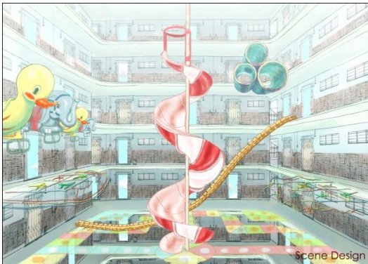
“Well in 80s” by Chau Pak-ho Noel