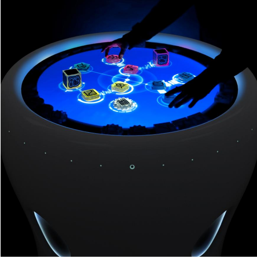
Reactable by MOS