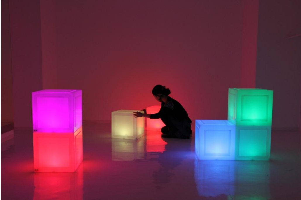
Media Block Chair by teamLab